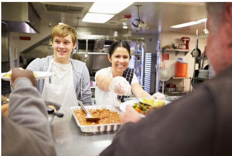
Volunteering has benefits for the volunteers, too.

These are the very same neural networks that undergo the most change during the adolescent years. The networks seem to be active during the complex decision-making – to whom, when, how much, do they really need it? – that can be involved in sharing resources, support and effort with others. It's tricky to work through these kinds of difficult questions. The developing brain may enable youth to learn how to make the computations necessary to answer them.