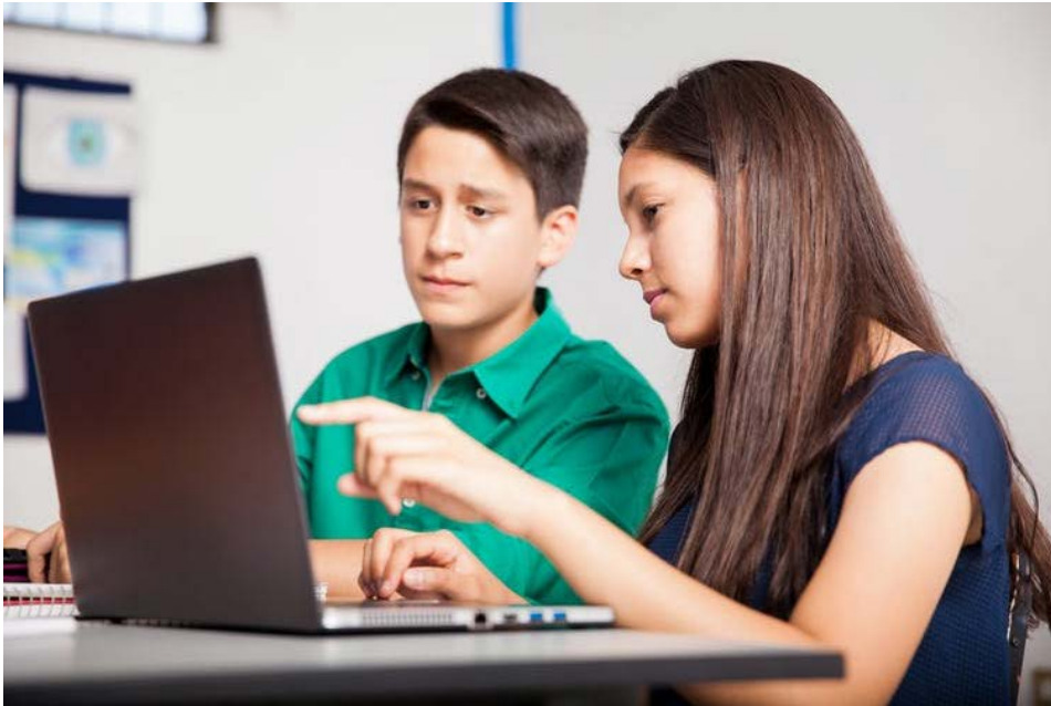
Teens can help other students outside the classroom.

First think about the home setting. Do families give adolescents a chance to participate in decision-making that affects themselves and their relatives? Do youth make instrumental contributions to their families, whether through daily chores or in more substantial ways like helping siblings with schoolwork?